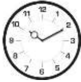
1. clock / block

I. Say the words aloud, then circle the words that matches to the pictures.