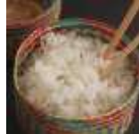
14. __icky rice