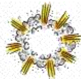
7. clash / blast