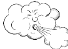
11. blow / close