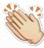
3. blame / clap