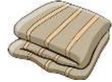
4. clasp / blanket