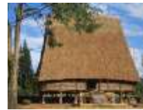
11. __ilt house