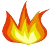
2. blaze / clay