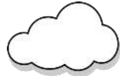
8. cloud / blouse