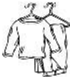
9. clothes / blossom