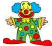
10. blown / clown